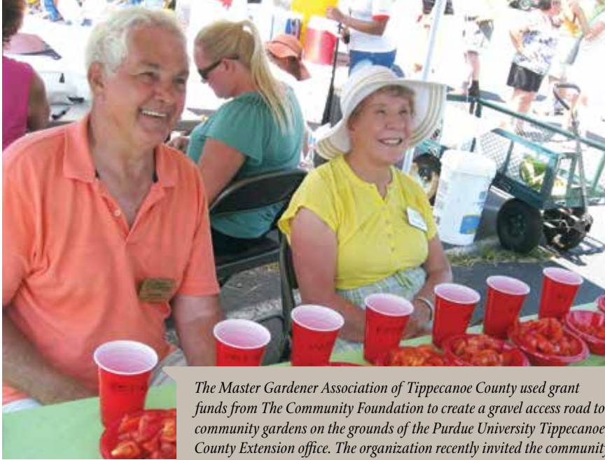
The Master Gardener Association of Tippecanoe County used grant funds from The Community Foundation to create a gravel access road to community gardens on the grounds of the Purdue University Tippecanoe County Extension office. The organization recently invited the community to sample tomato varieties at an open house and picnic, pictured.