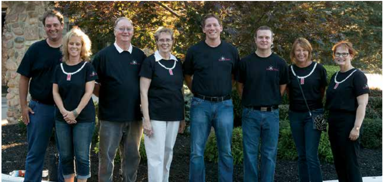
First Source Bank sent these representatives and sponsored the air conditioned tour buses.