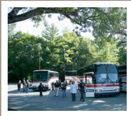
The evening's highlight was touring local nonprofits.

Gifts should be designated for a specific agency or agencies.