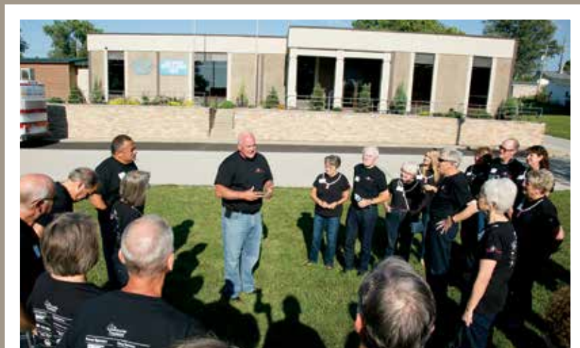
A tour of the Lyn Treece Boys & Girls Club and its gardens was a hit.