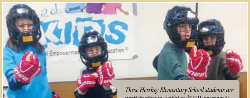
These Hershey Elementary School students are participating in a pilot radKIDS program to learn how to keep themselves safe.