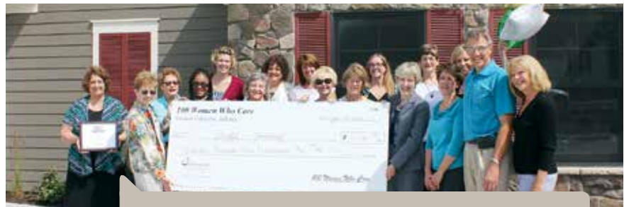
The Community Foundation's 100+ Women Who Care is helping nonprofits achieve their missions. Pictured are group members and Joyful Journey representatives who accepted the contribution.