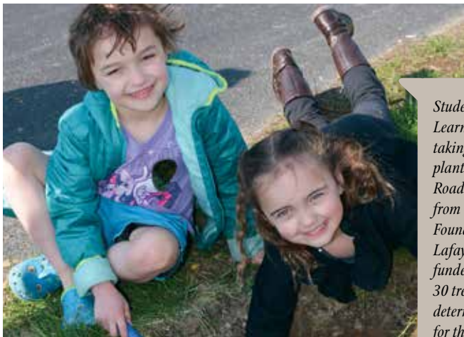
Students from Burgett's Learning Center are pictured taking a break after helping plant trees along Kalberer Road this spring. A grant from The Community Foundation to the West Lafayette Parks Foundation funded the purchase of 30 trees, part of a trial to determine optimal choices for this area.