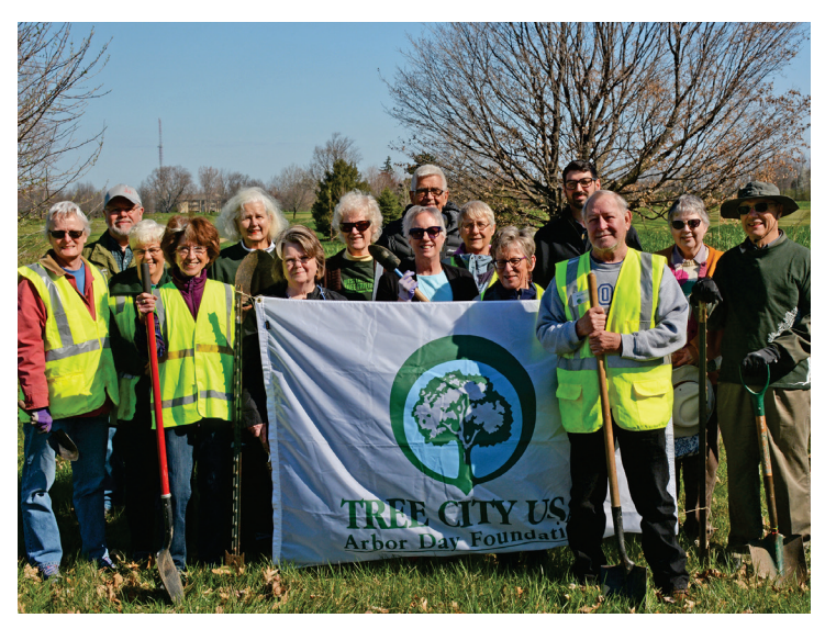
West Lafayette Tree Friends volunteers

The West Lafayette Tree Friends Endowment was established in 2020 to support a vital urban forest in the community, planting and replacing trees. Trees are not only beautiful, but they also provide oxygen, absorb stormwater, and offset our carbon footprint. The endowment safeguards the legacy gift so it can have an ongoing positive environmental impact. If your agency or organization is looking for a way to provide lasting income to meet tomorrow's needs, consider establishing an agency endowment through The Community Foundation.