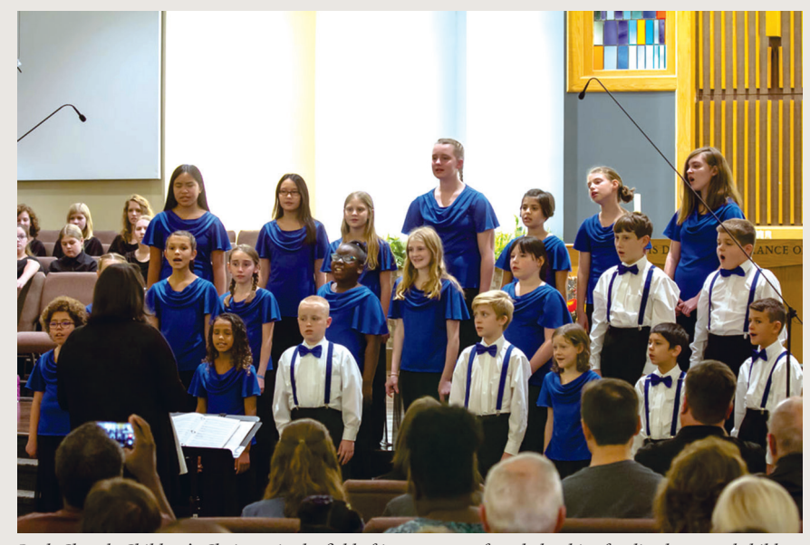
Bach Chorale Children's Choir received a field of interest grant for scholarships for disadvantaged children.