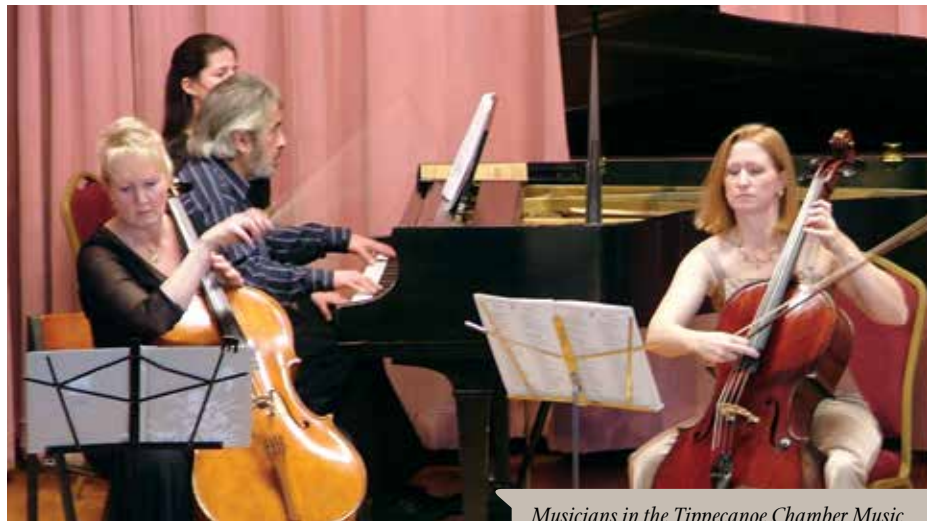
Musicians in the Tippecanoe Chamber Music Society often perform in small ensembles.

Brass Blowout! | June 2, 3 p.m. | Purdue’s Fowler Hall