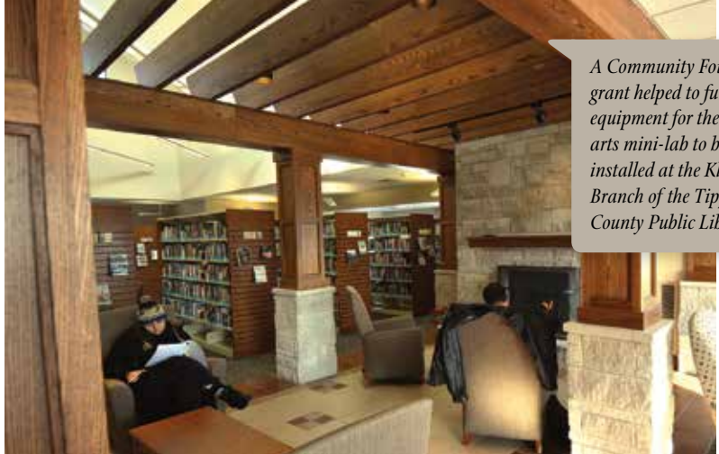
A Community Foundation grant helped to fund equipment for the digital arts mini-lab to be installed at the Klondike Branch of the Tippecanoe County Public Library.

West Lafayette Parks Foundation $1,585, slab roller and table for pottery classes