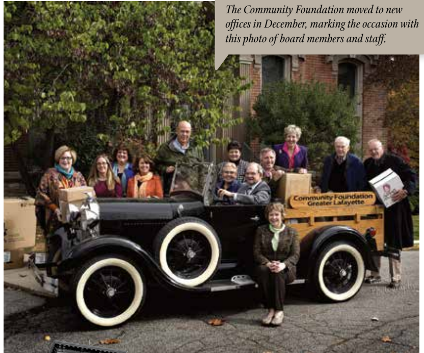
The Community Foundation moved to new offices in December, marking the occasion with this photo of board members and staff.

Offices are currently on the second floor, with a spring move planned to the first floor once remodeling is complete. An open house will follow soon after that move. Parking is available on-street or in the Renaissance Parking Garage.