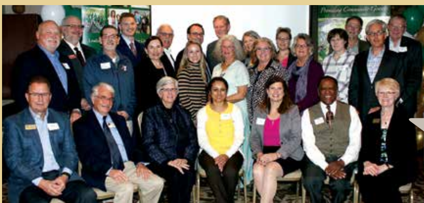
Representatives from the 30 nonprofits participating in the Geddes Matching Campaign gather.

Participating agencies are listed online at www.cfglaf.org .