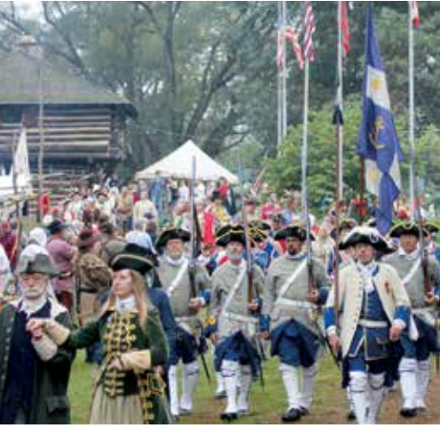
Tippecanoe County Historical Association received a grant for the restoration of Fort Ouiatenon Blockhouse.

Spring grants awarded in April, were awarded to eight nonprofits. The total disbursed was $124,842.