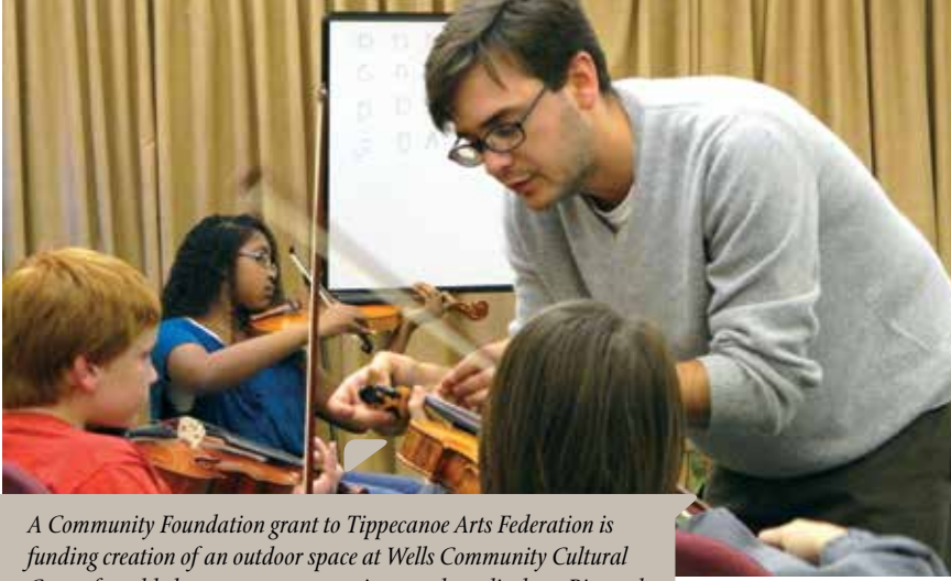
A Community Foundation grant to Tippecanoe Arts Federation is funding creation of an outdoor space at Wells Community Cultural Center for added programs, presentations, and art displays. Pictured are youth participating in the after-school arts program.