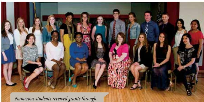
Numerous students received grants through Community Foundation funds this year.