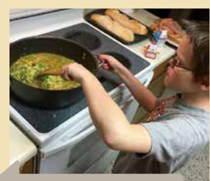
A check to Lafayette School Corporation was the first contribution of Men Who Give. It supports the World Foods and Cultures program at the Learning Center.

Four one-hour quarterly meetings to choose a recipient and a promise to contribute $520 over the year are all it takes to join Men Who Give, which convened in February. Of that, $100 goes to a Men Who Give Endowment, $20 for program