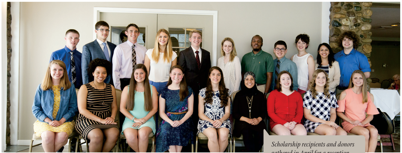
Scholarship recipients and donors gathered in April for a reception.