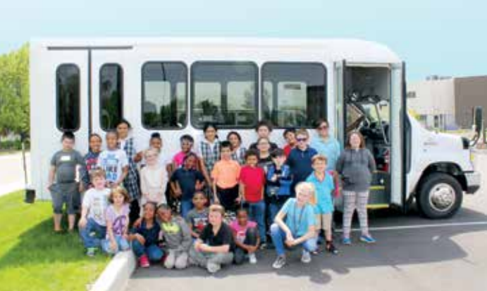
A grant provided this new mini-bus to Hanna Community Center.