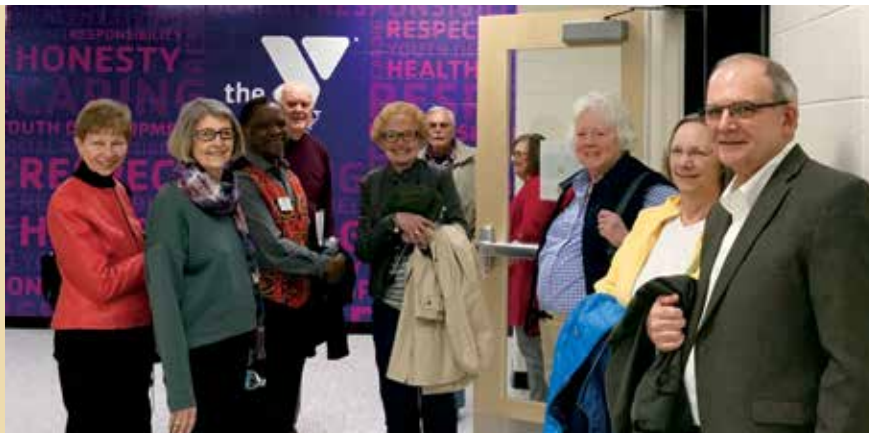
The Donor Advisory Council gets an inside look at the Lafayette Family YMCA and Junior Achievement.