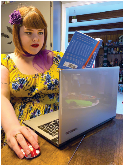
Heartford House employees received laptops to work from home.