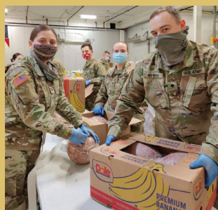
U.S. Army Reserves assist Food Finders in response to COVID-19. Funding from endowments provides more food to meet the growing need, and protective gear and boxes for food distribution.