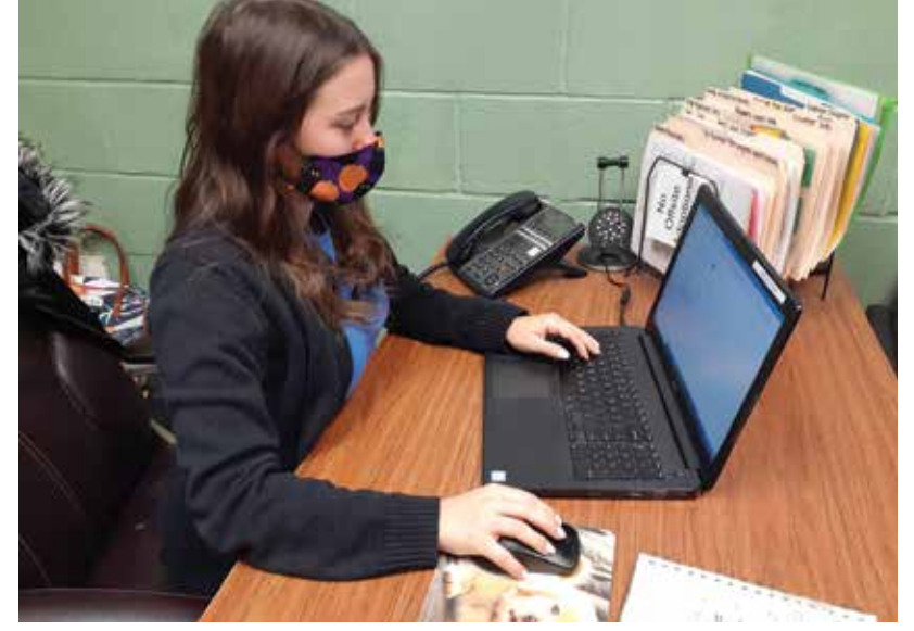
Almost Home's technology grant is helping them adopt dogs to loving homes.