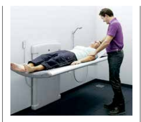
Wabash Center received a grant for changing tables to help individuals with mobility challenges.

The Community Foundation gave the organization a fall grant of