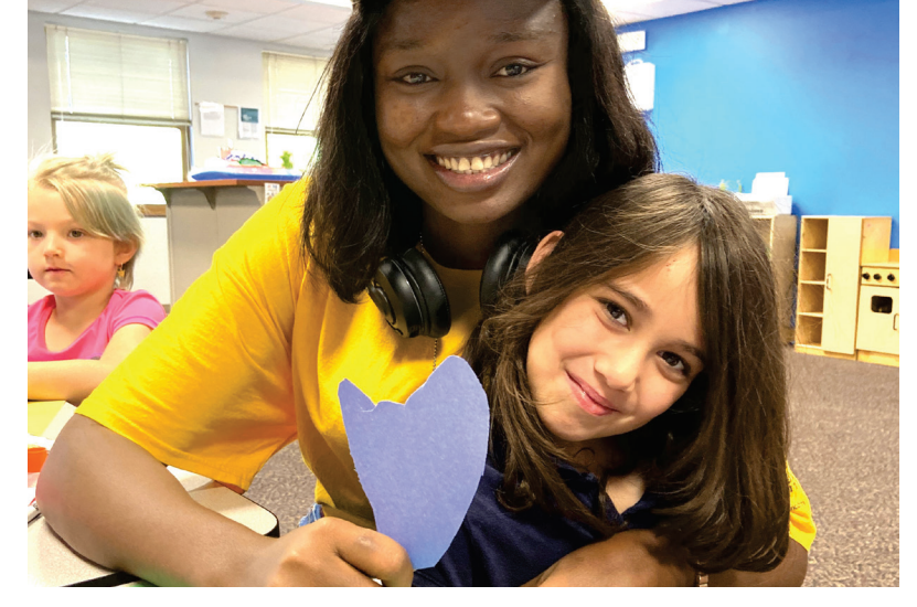
5th Quarter Summer Learning Program at Lafayette Urban Ministry